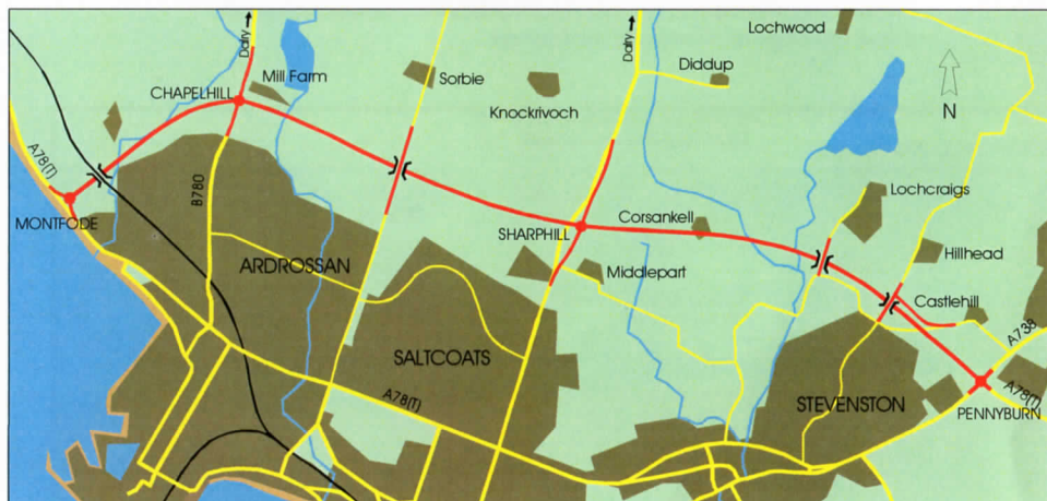
Schematic of the Proposed Bypass