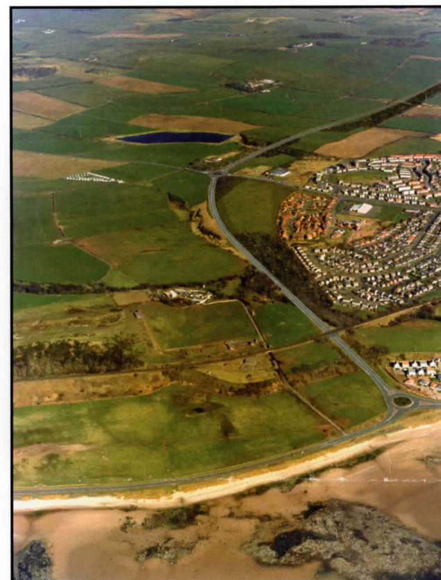
Photomontage at Montfode, Ardrossan

These are benefits which will be realised by both the non-motoring and motoring communities of the Three Towns.