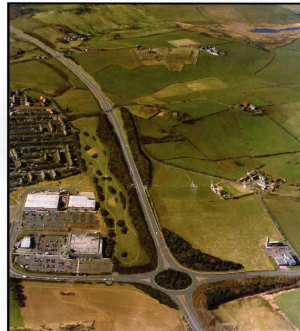
Photomontage – Pennyburn, Stevenston